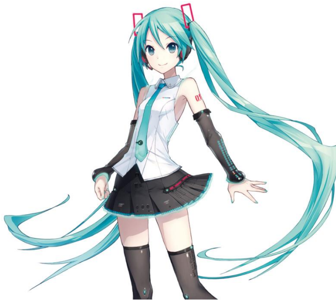
Image Description: Official Artwork of Hatsune Miku (Japanese: 初音ミク), a Japanese Virtual Idol developed by Crypton Future Media. She has turquoise eyes and her hair is also turquoise. Her hair is styled into a twintails style, held in place by two large red hairclips that are also part of her red headphones. She is wearing a sleeveless white shirt with a turquoise tie and black skirt, gloves and leggings. Her gloves and skirt are adorned with a series of red and turquoise lights. She has a visible red tattoo of the number "01" on her left arm.