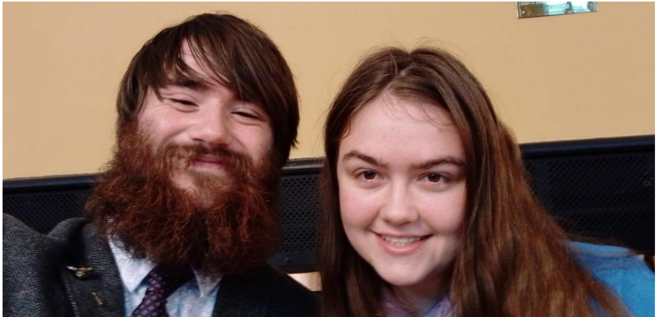
Image Description: A landscape selfie of myself and the Accommodation Senator Luka Pranciliauskas inside Pugin Hall. We are attending a different graduation and as such are smiling very happily as we watch the different group of happy graduates.