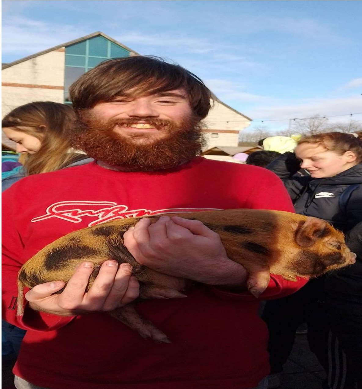
Image Description: A picture of me attending the Baby DeStress Animal Petting Event. The photo is a wide shot of myself and a pig. I am holding the pig. I am wearing a red long sleeve shirt while holding the pig. The pig is relaxing in my arms. The arms that are holding the pig. I have a massive smile on my face as I hold the pig.