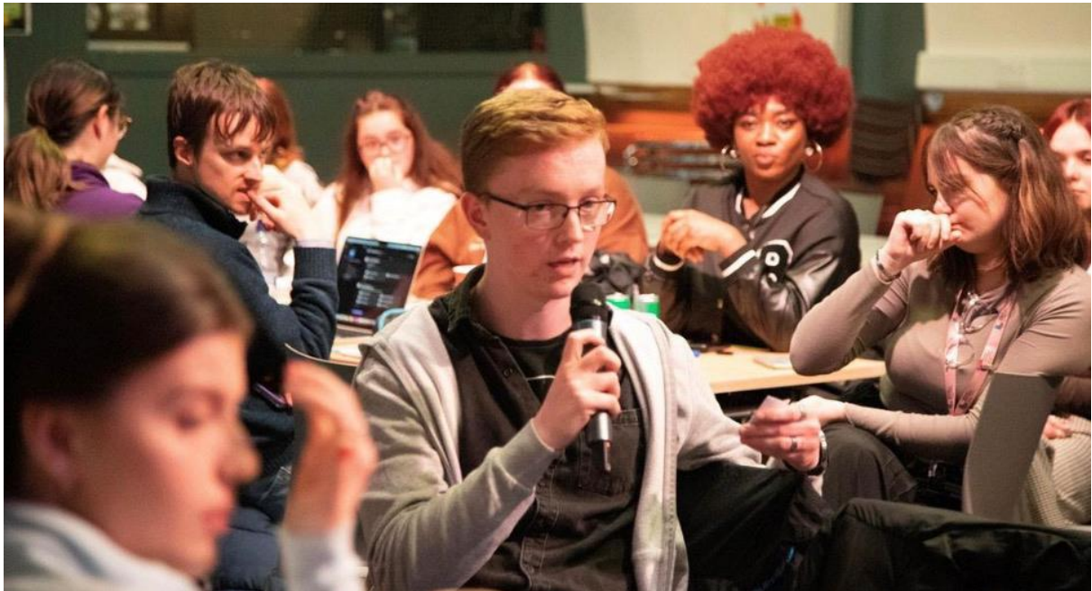
Figure 3 Academic Reps listening to one another make speeches as they run for various committees of the MSU Academic Assembly.

Furthermore, I would like to take this opportunity to everyone who kindly brought some resources and goodies for reps to use whilst in their roles.