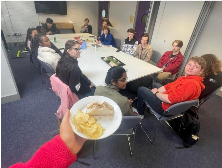
Figure 9 Academic Rep candidates getting to know each other

29 th September – Clubs & Socs Fair day - Academic Rep Recruitment