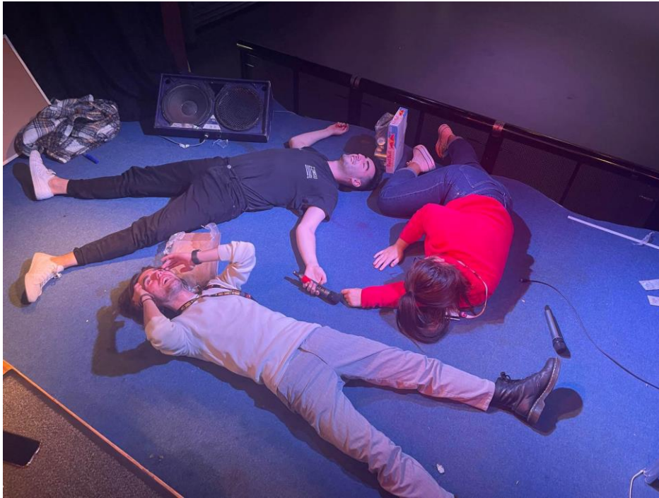
Figure 8 MSU President, VPE, and VP SL tired after delivering all of the orientation talks