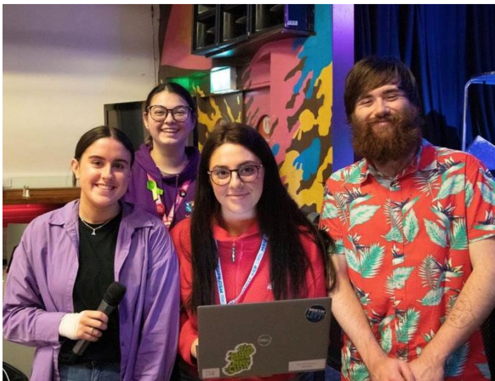
Figure 4 The VP Education, ACSP, SS, & S&E Faculty Convenors