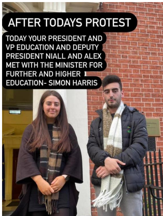
Figure 10 MSU President and VP Education after meeting with Simon Harris