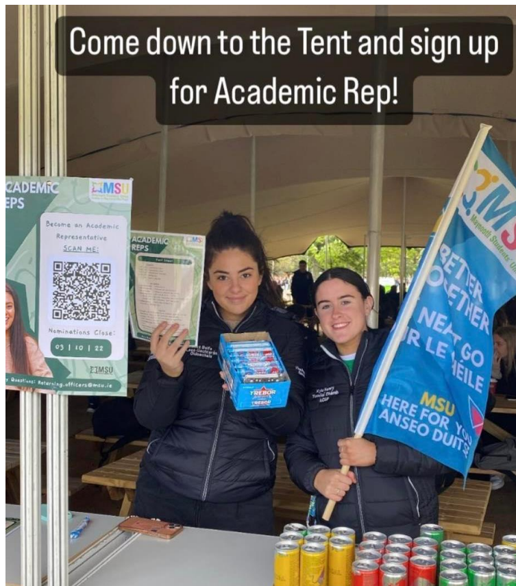
Figure 1 VPE and ACSP FC recruiting reps outside JH