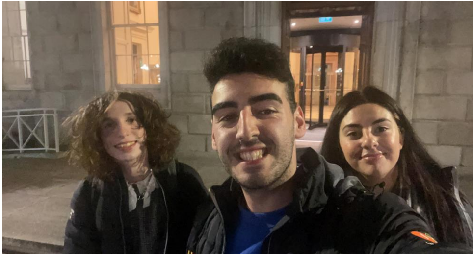
Figure 11 MSU President, VPE and VP W&E outside the Dáil