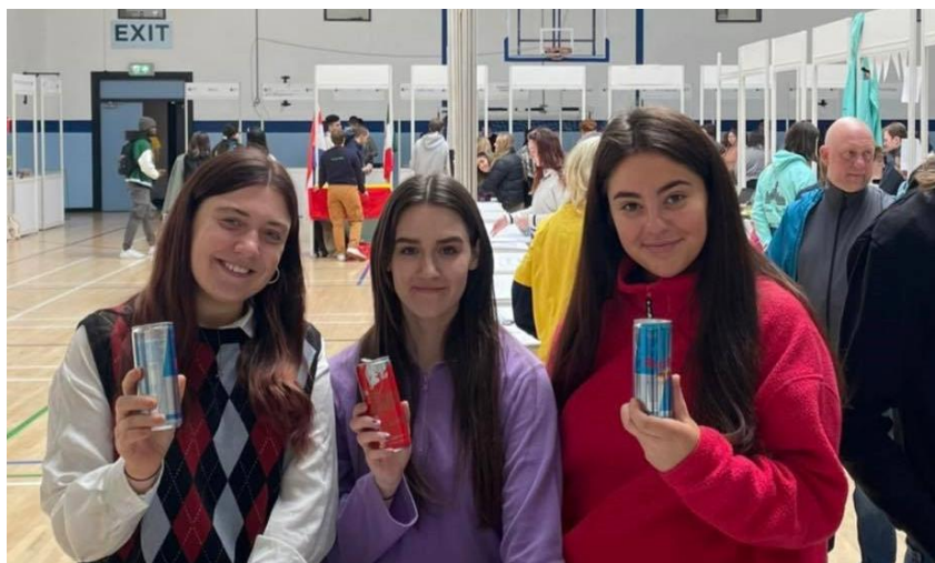
Figure 2 VPE, USI VP AA and MSU Active Citizenship Senator recruiting reps at fairs day

We also had a stand for the two days of the Clubs and Socs fairs day. This was a static stand for students to come and ask any questions about running for elections. Many thanks to all who helped out with this stand too.