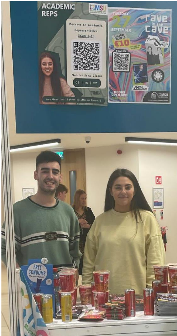
Figure 7 MSU President and I giving away freebies and recruiting reps