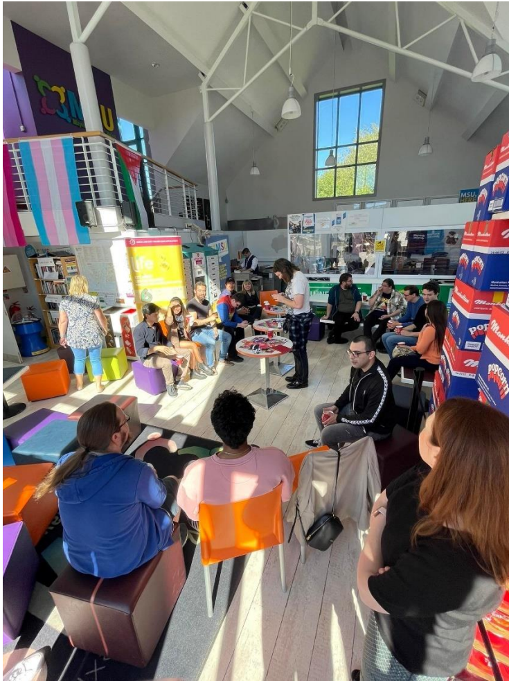
Figure 6 PG and PhD Students meeting one another in Your Space